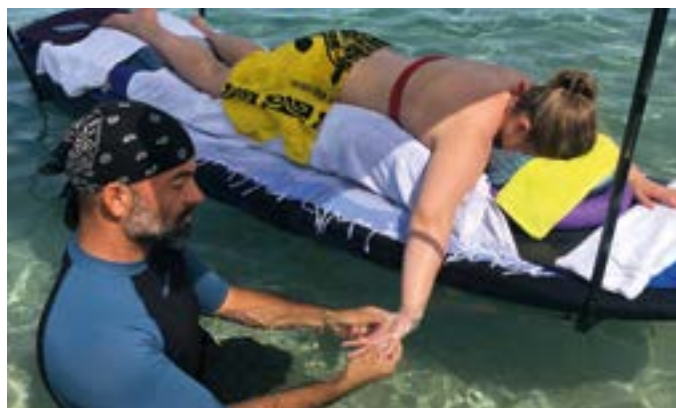
Massage à la plage