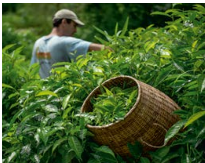
Le labyrinthe en champ thé