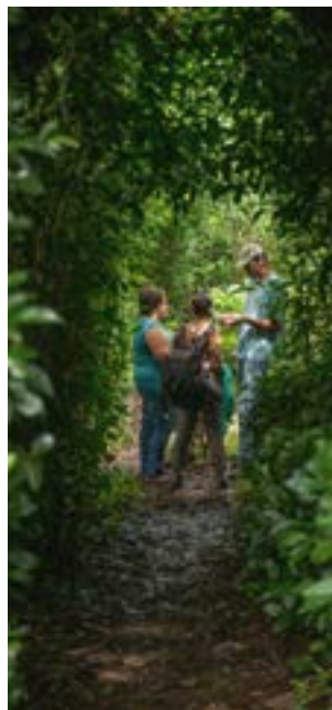
Le labyrinthe en champ thé